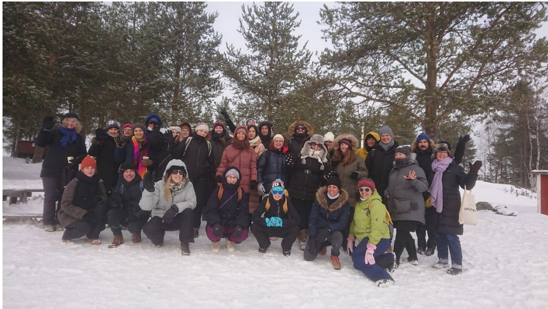
Fig. 8: Staff week participants

programme. Everything together made Luleå an unforgettable experience for me, for which I am very grateful. I will definitely apply for a staff week again.