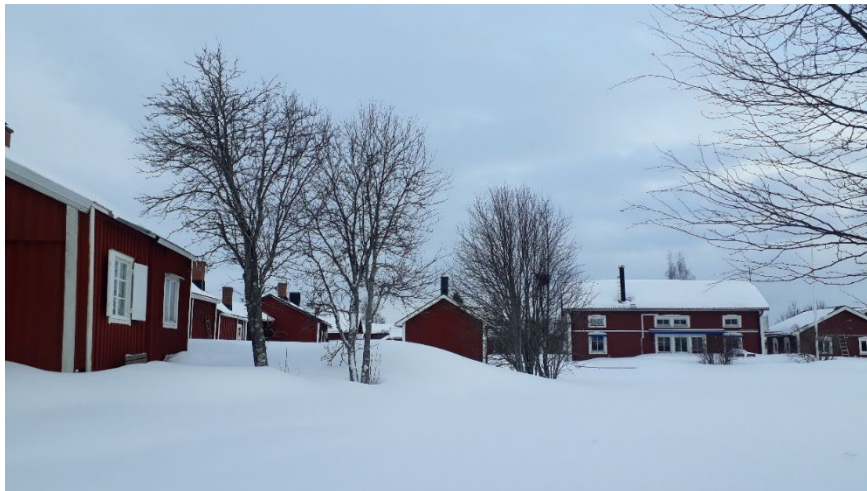
Fig. 6: Gammelstad church town