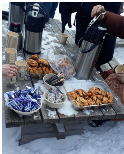
Fig. 5: Fika

Thanks to the cultural activities organised by the host university, the group grew closer together and all participants were able to expand their network. One of the daily highlights of the Swedish culture turned out to be the fika, a typical coffee break with a chat and delicious sweet pastries. Sledding on Luleå's Ice Road and a visit to the UNESCO World Heritage Site of Gammelstad church town completed the great days in Luleå. The perfect ending was a dinner together, after which we went outside to see and marvel at the amazing northern lights.