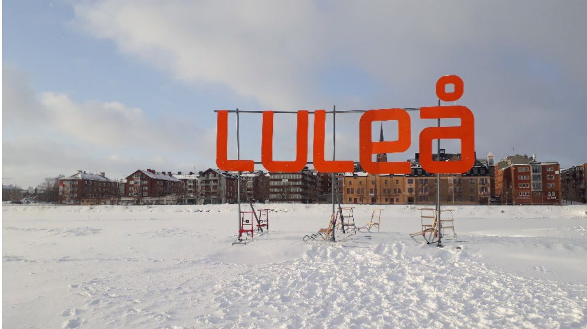
Fig. 1: Luleå in March 2023