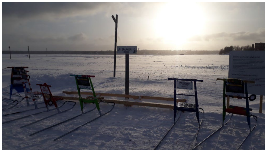
Fig. 7: Ice road